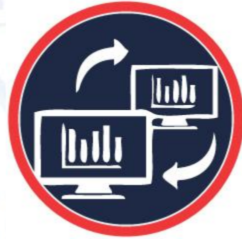
Real-time Data Sharing