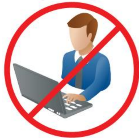
No IT Personnel