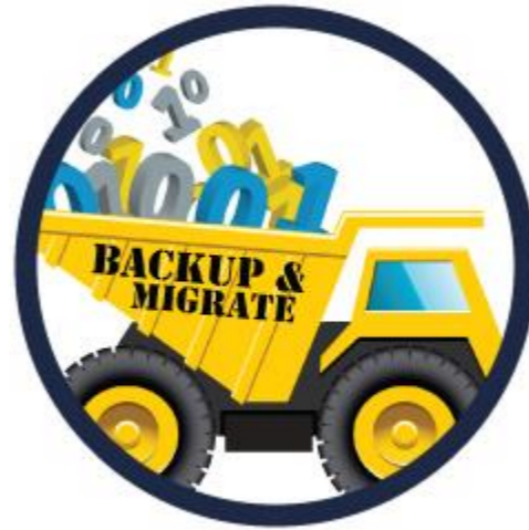
Back-ups & Migration