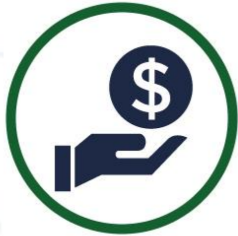
Light on Pocket